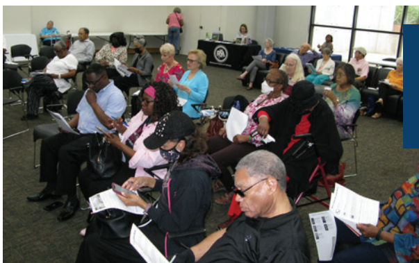
The District 2 meeting in Mobile was well attended