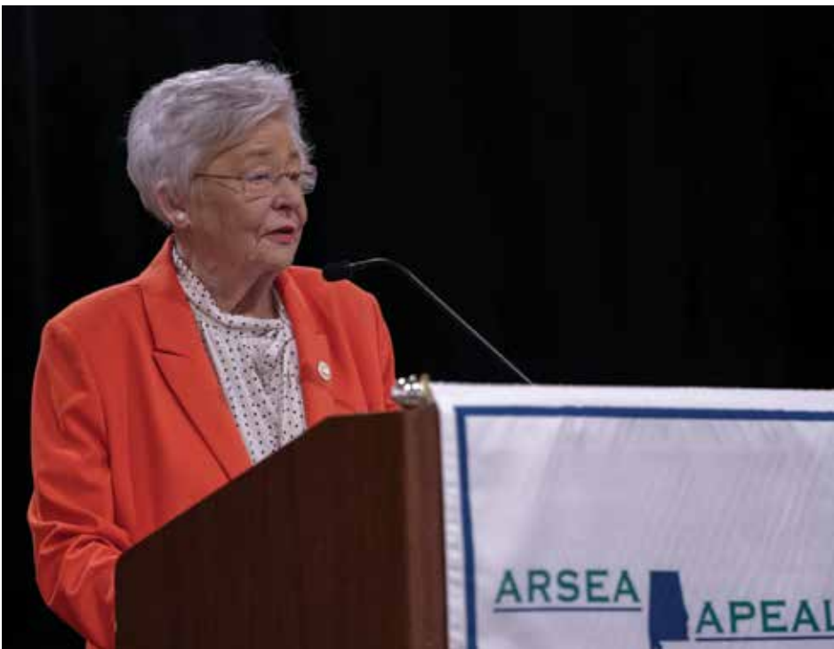
Governor Kay Ivey gave the Keynote Address at the Annual Meeting.