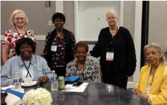
Members and leaders from Central Alabama gathered to hear about the plans for 2025 at the Annual Meeting